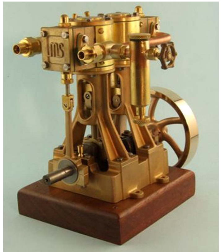
3. Fully Assembled Non Reversing Engine