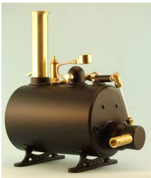
"Miniature Steam" 4 Inch Horizontal Boiler

The "Miniature Steam" Mildura steam engine is made from highest quality materials. The cast components are made from a combination of bronze and copper based marine grade alloy using the lost wax (investment) casting process. This casting process produces a super fine surface finish in combination with accuracy of detail and dimension. The fully balanced crankshaft is made from Spheroidal Graphite (S G) cast iron to achieve optimum mechanical properties. The remainder of the machined components are made from brass and stainless steel. This combination of alloys provides maximum protection from corrosion and durability during service life of the steam engine.