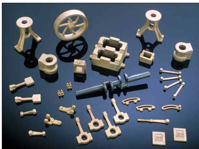
4. Reversing Casting Kit for Machining