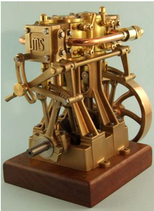
2. Fully Assembled Engine with Manually Operated Reversing