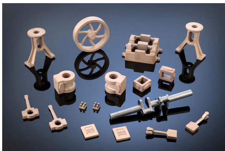
5. Non Reversing Casting Kit for Machining

Replacement parts are available for all engine components.